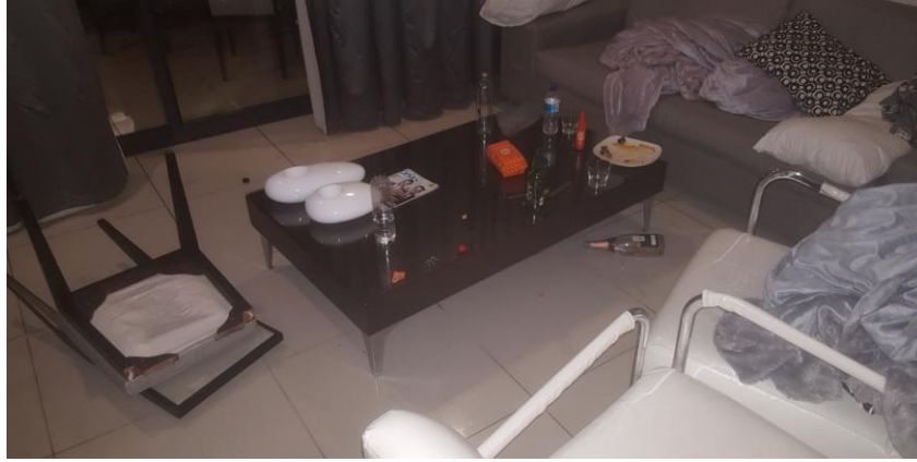
A chair was broken during the altercation.