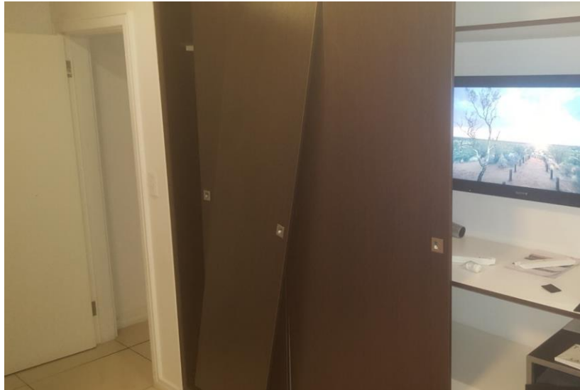
A cupboard door was broken.