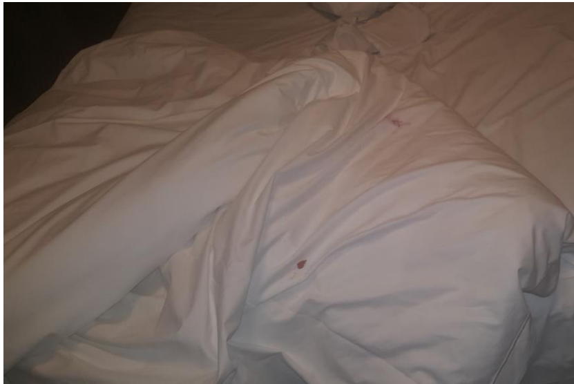
Blood stains were visible on the linen.